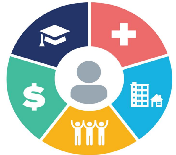
Social Determinants of Health

Social Determinants of Health Copyright-free