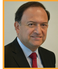
Pedro Pacheco Villagrán CONAC President 2013